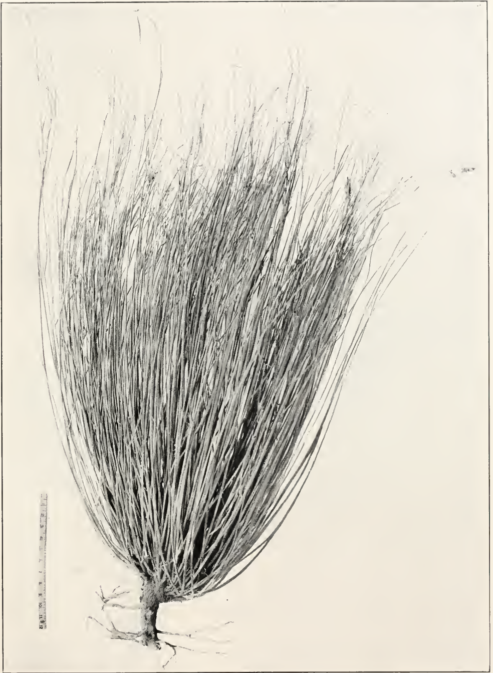
Asclepias subulata , collected at Sentinel, Arizona. Plant 5 feet high.